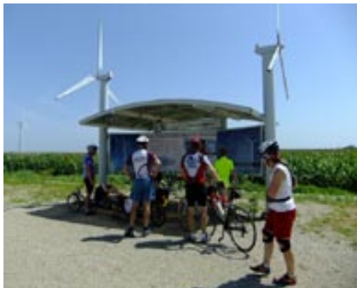
This Iowa wind farm had an information booth.