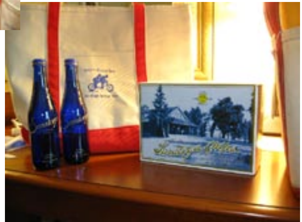
Saratoga Springs water and Saratoga chips - the original potatoe chip