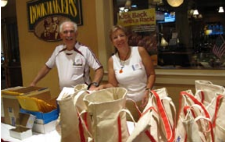
Smiling faces and re-usable goodie bags filled with 'Saratoga Stuff' greeted us as we arrived for our 4th of July weekend.