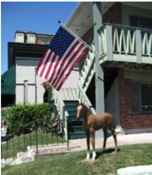
Saratoga is all about racing - horses everywhere.