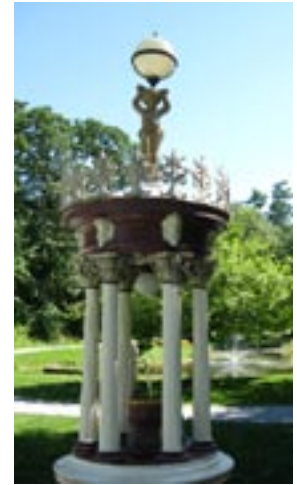
One of the springs - this one was available for drinking.