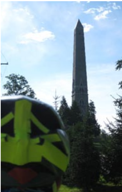
The Saratoga obelisk.

Burgoyne's strategy called for a three-pronged attack, including attacks from the west, and General Howe's army moving up the Hudson River from New York City to rendezvous with Burgoyne at Albany. But Howe had a plan of his own and set out to attempt a capture of the rebel Continental Congress at Philadelphia. Unfortunately he didn't tell