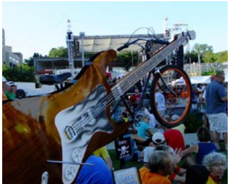
One of many amazing bicycle sculptures along the route.

We were glad to move out of Waterloo and on to Manchester early that morning, especially before the building downpour turned the field into a torrent of mud. It was cold, however, and riding 57+ miles in the pounding rain with thunder crashing overhead and rain slashing at our arms was tough. On this day, the uphill were our friends, keeping us warm as we generated our own heat. But the following downhill caused us to chill to the bone. After 40 miles, Kyle and I stopped at a local gas station for hot