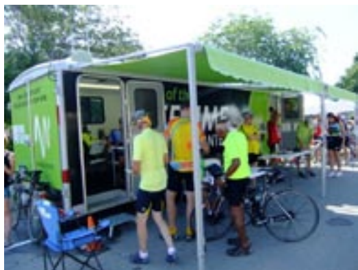
WiFi - some can't leave it home.

chocolate. We were in good company as about 100 other dripping wet, shivering riders milled around, sipping hot beverages. Kyle and I perched near the pizza heater, enjoying the warm blast with each slice removed. I stood behind Kyle wrapping my arms around him in a close bear hug, sharing our warmth as we stood, when we were joined by four big, tall, male bicyclists also standing near the pizza heater, shivering and drinking mocha, their rippled muscles coated in goose-bumps. They seemed to eye us curiously. We all stood there a long half hour or so, chattering teeth and shaking limbs beginning to calm, when one of them blurted to the others, "I wish MY mom was here to give me a hug right now!" After a good chuckle we darted back out into the rain for the last 20 some miles of cold riding. We arrived just as the sun was peeking out, so thankful that Mike had pushed through and already set up our tents! Kyle stripped off the wet clothes and dove into his sleeping bag for a long snooze! Connor joined us (an anxious 20 minutes) soon thereafter; he fell asleep immediately, with his cell phone in his hand and his Ipod connected to his ears.