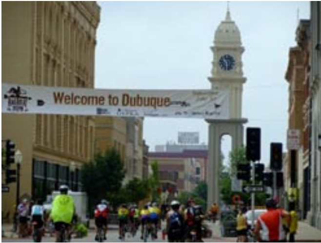
Many towns had welcome banners - Dubuque was our final goal.