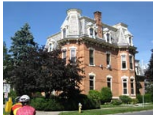
Lots of fantastic homes too.