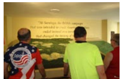
The battles display.