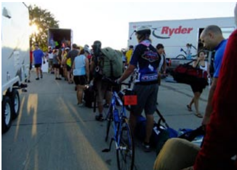
Lines, lines and more lines - this one gets our gear into the semi for its ride to our next stop.