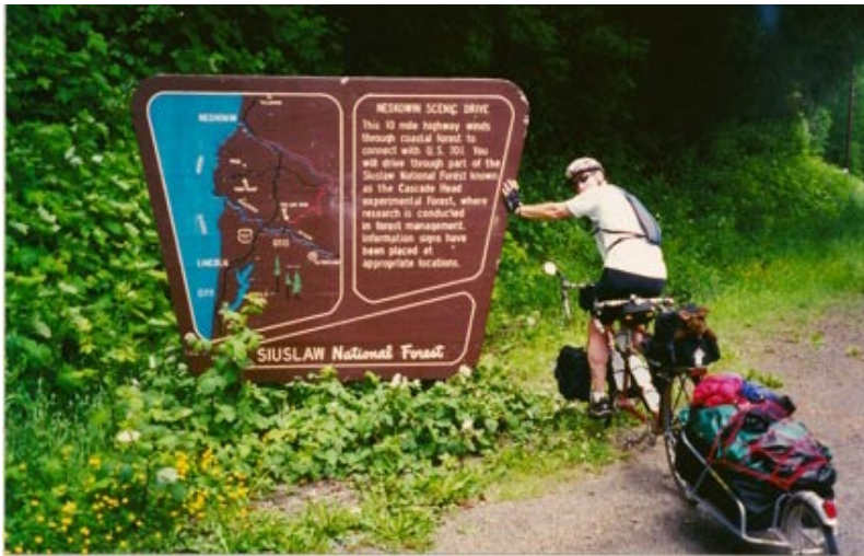
Siuslaw National Forest near Neskowin, OR

and low in their pockets and their pickup, all but removing the seats and dashboard trying to find some change. Heroic effort, but to no avail, so the pair returned to the women's shower and proceeded to share one 3 minute quicky (shower, that is).