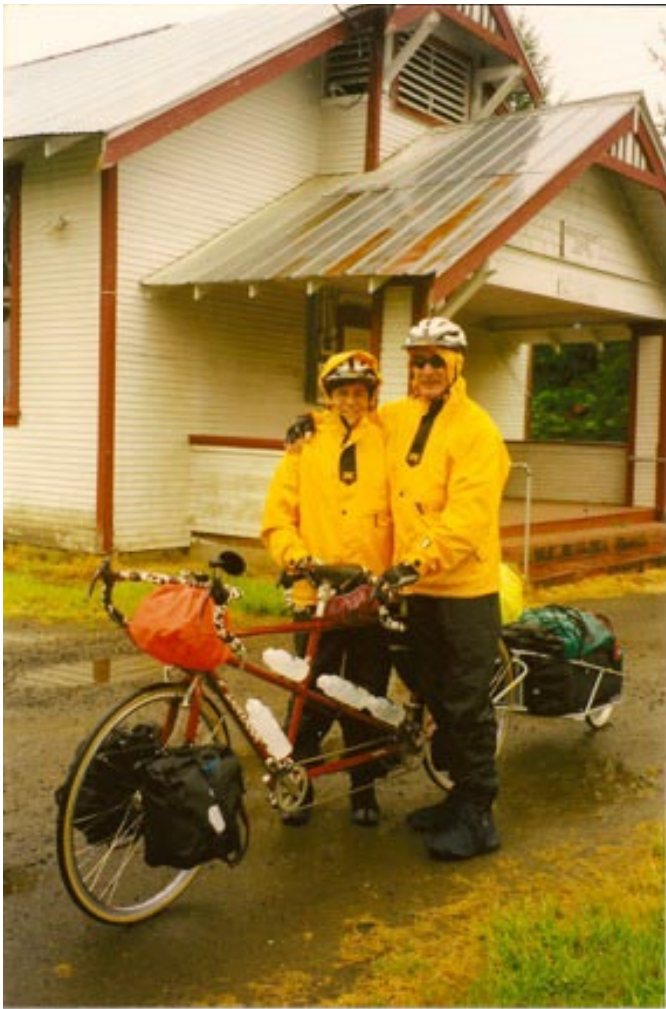
Cross Country - Day 1

cool shaded forest with virtually no traffic. At one point there appeared just ahead, a little spotted fawn standing on the edge of the road, but by the time Pat had found the camera, it thought this freight train on 3 wheels and its operators looked like trouble and disappeared into the cover of the trees. (You don't suppose it caught the scent of a moose, do you?)