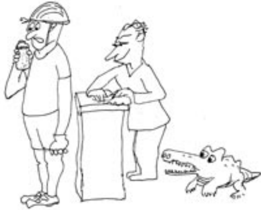
"You say this is home-made Gatorade?"