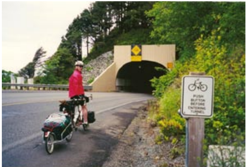
Ready to enter an Oregon tunnel

The creaky pedaling pair discovered, as they arrived in Astoria, late on June 9, that a rest day was needed (they said this biking while loaded with camping gear had turned out to be real work!). As it turned out, one rest day a week became pretty much the standard for the whole trip. So, they spent the following day poking around this pleasant small city and Mike even found a woman at the local street fair who was offering mas-