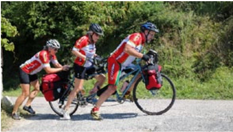
Team BS needs a p-u-s-h!