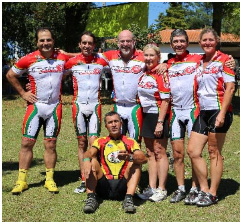
Teams BS & DL pose with their new Portuguese cycling friends on Day 2.