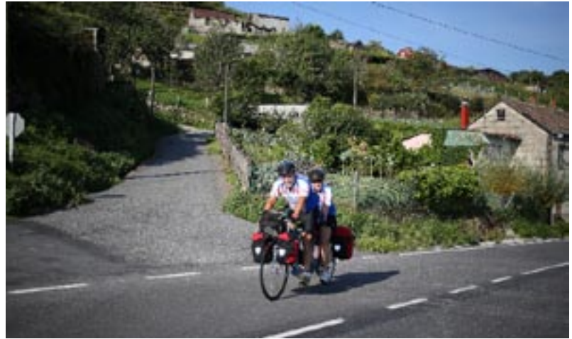
Team BS on a climb.